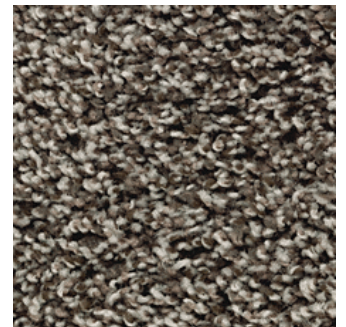
Bordeaux River | 879

Call or go online to find your representative and order today.