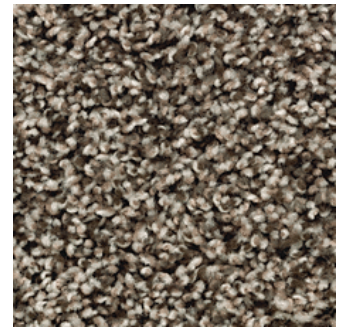
Autumn Leaf | 838