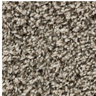
Virginia Mist | 825