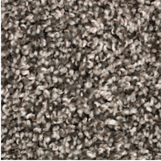
Stonewood | 937

Call or go online to find your representative and order today.