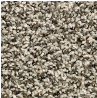
Antique Ice | 742