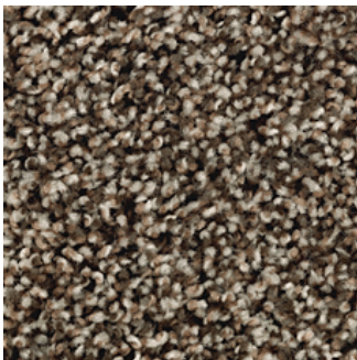
Dakota Dawn | 861