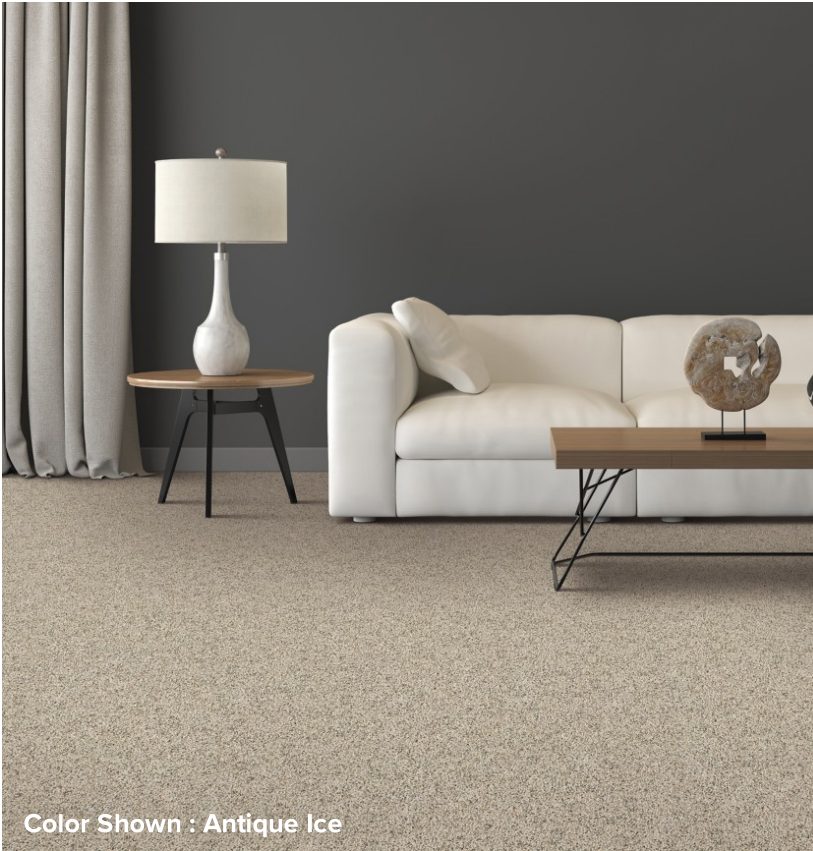
Color Shown : Antique Ice