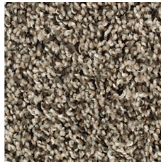
Venetian Gold | 832